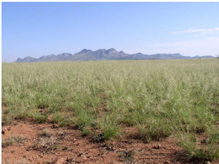
Loamy Upland 16-20" pz, Boer lovegrass

This state occurs where African lovegrass species have either invaded from established stands or from direct seedings of these areas. Lehmann, Boer, weeping lovegrass and in some places yellow or King Ranch bluestems are dominant and native perennial grasses and forbs exist only in minor amounts. Cover and production of these species is very high and site stability and hydrologic function are good.