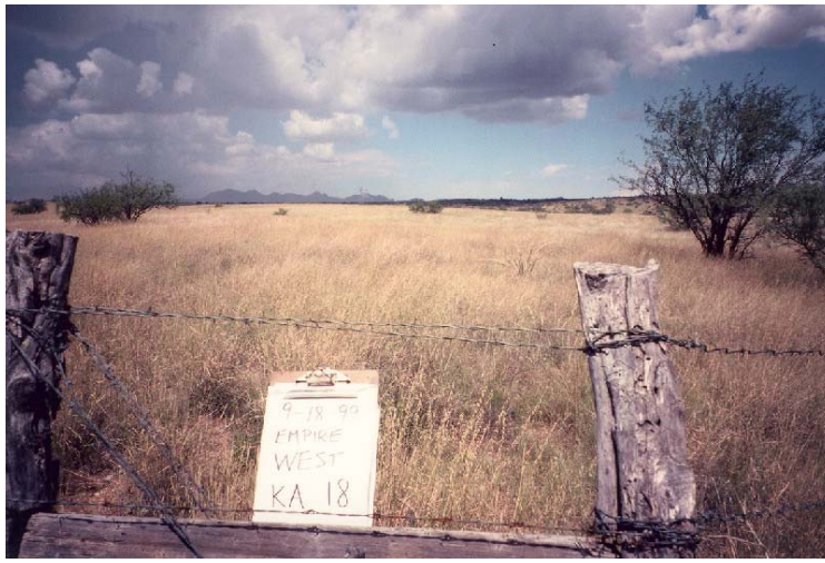
Empire Ranch, West Pasture enclosure, KA 17&18

The historic native state includes the native plant communities that occur on the site, including the historic climax plant community. The state includes other plant communities that naturally occupy the site following fire, drought, flooding, herbivores and other natural disturbances. The historic plant community represents the natural climax community that eventually reoccupies the site with proper management.