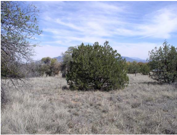
Loamy Upland 16-20" pz. juniper invasion

With continuous grazing, a nearby seed source and in the absence of fire for long periods of time; velvet mesquite and / or western honey mesquite and one seed or alligator juniper can invade and increase to dominate the site. Canopy cover can be from 2 to 25%. Sheet and rill erosion can begin to accelerate at the higher canopy levels.