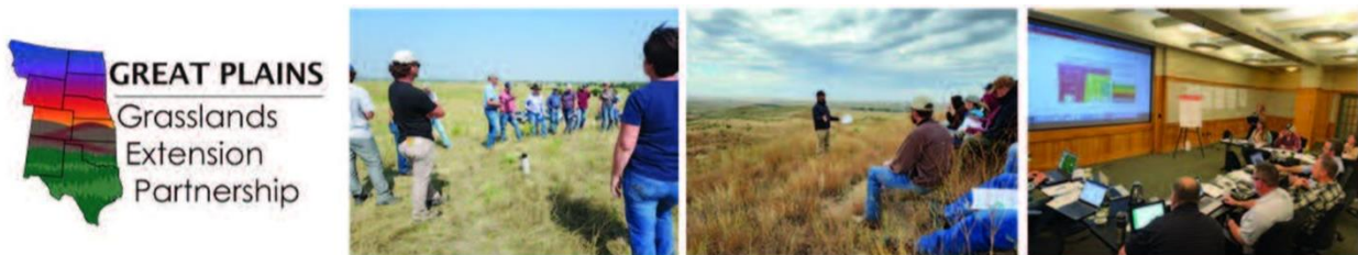
Figure 3. The Great Plains Grasslands Extension Partnership has supported a regional extension and outreach campaign to speed up the adoption of new management guidelines for reducing woody encroachment.