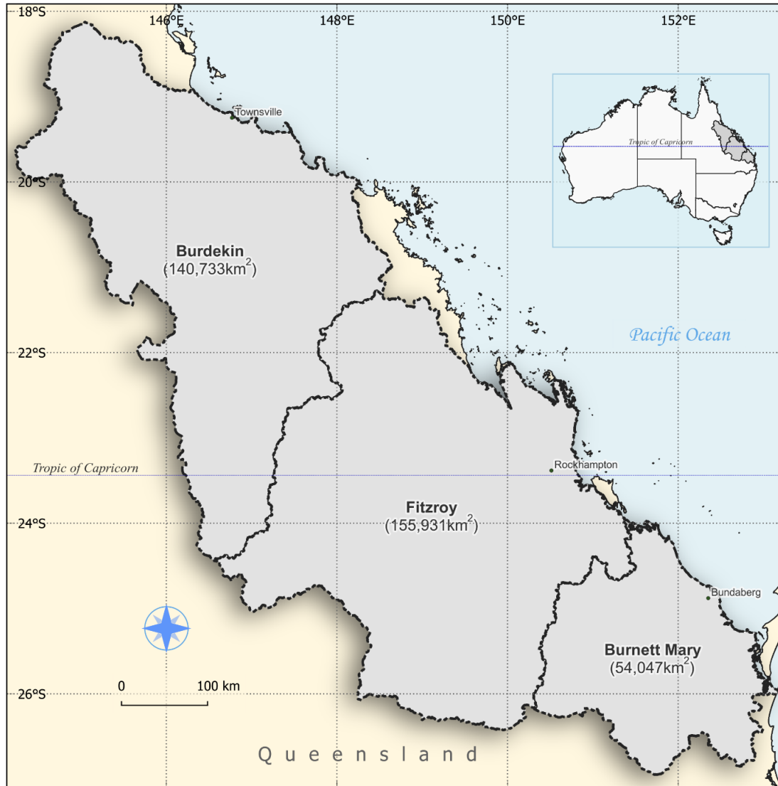
Figure 1. Location of the study area.