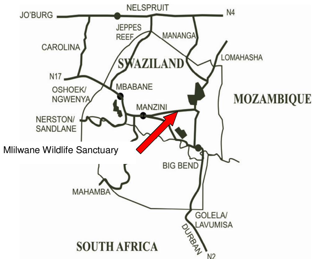
Figure 1. Location of Mlilwane Wildlife Sanctuary in western Swaziland.

regeneration by suckering (Dean et al., 1986).