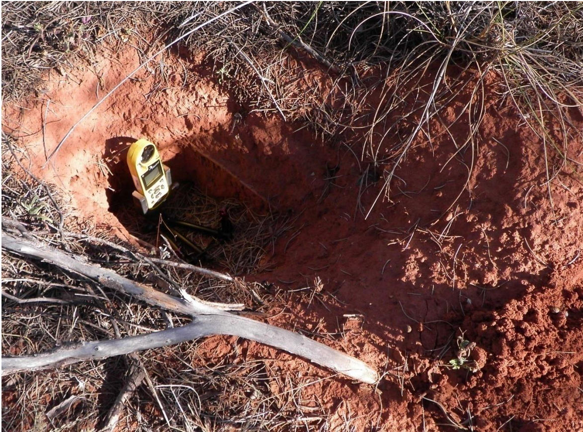
Figure 2 Microclimate logger in a c. three year old bilby digging (Photo Tamra Chapman / DEC).