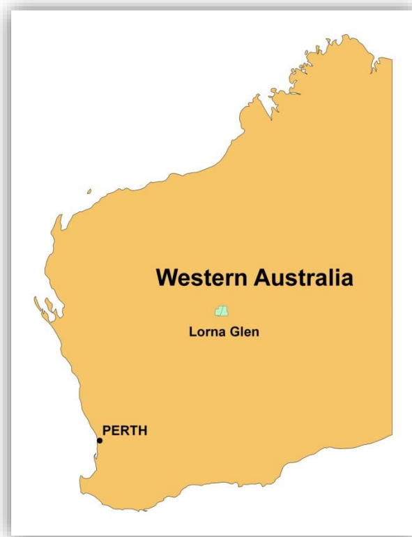
Figure 1 Location of Operation Rangelands Restoration, Lorna Glen Western Australia.

Lorna Glen is a 244,000 ha proposed conservation reserve managed by the Department of Environment and Conservation in conjunction with the Martu Aboriginal community from nearby Wiluna.