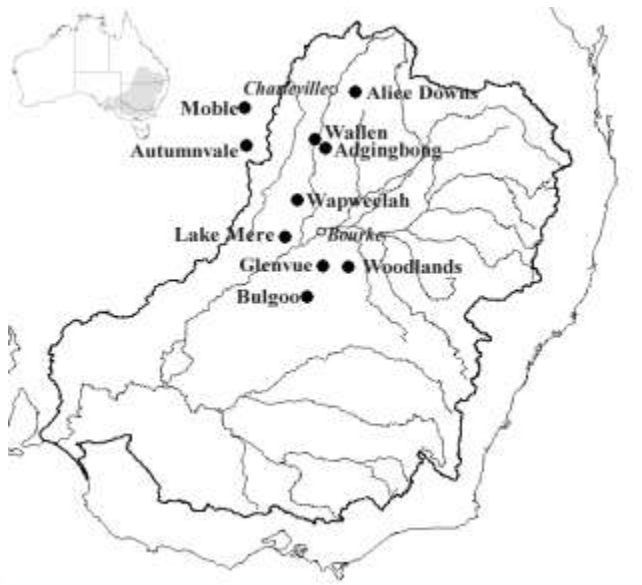
Fig.1. Pastoral properties (solid circles) selected for standardised grazing treatments. Boundary of the Murray-Darling Basin, two major towns in the north-west of the Basin (open circles) and major rivers are shown.

(water and nutrients) within the “linked” landscape (Tongway and Ludwig 1997) and property owners to be interested in, and committed to, a research partnership for 10 years.