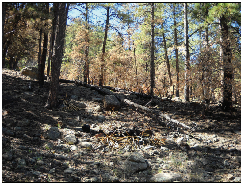
The landscape may not look pretty just after the fire, but this treatment may be an important part of maintaining or rejuvenating this ecosystem.