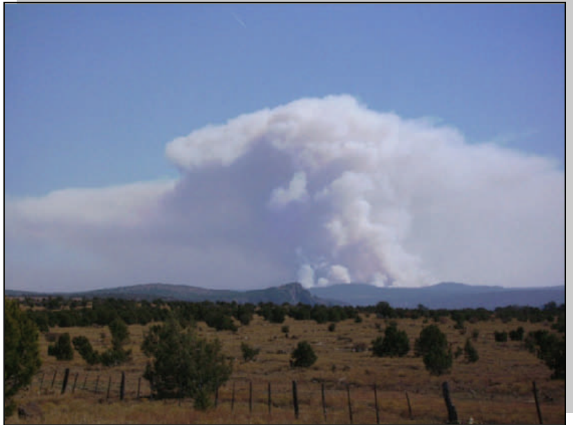
A prescribed fire burning southeast of the V Bar V.

“It did $1 million worth of improvement.”