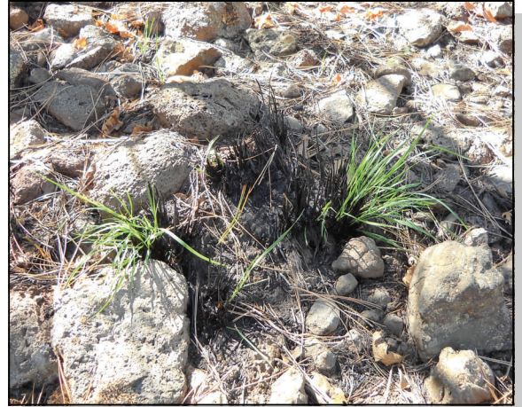
Grass re-growth on a burned area of Mingus Mountain approximately 45 days after an August wildfire

Shooting a single shot, I soon learned to make the best of the one shot I had when the opportunity came. I often did harvest one or maybe two partridge on my walk out one tree line and back to the farm on another. On Saturday, if wind was right, I would get to participate in burning the ditches of the country roadsides. There is something magical about fire in the eyes of a young boy. Ditches were burned to prevent the drifting of snow across the roadway caused by grasses that grew tall along country roads.