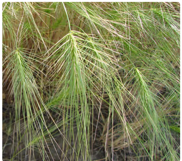
Figure 1. Medusahead in an invaded area.